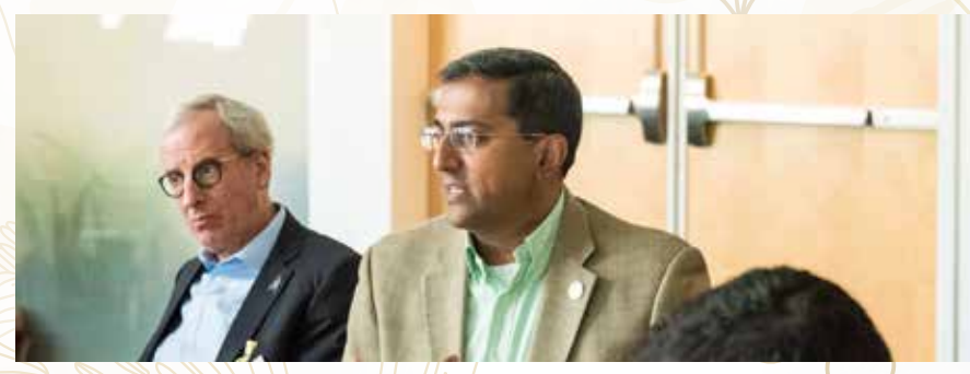
I toured Google's headquarters in Pittsburgh with the House Democratic Policy Committee for a hearing on artificial intelligence. This technology is revolutionary, but we must regulate it. That is why I introduced H.B. 1663, which would regulate health insurance companies' usage of Al.